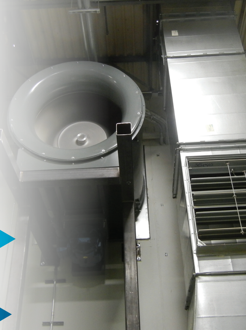
The centrifugal fan evenly distributes warm air from the compressor room.